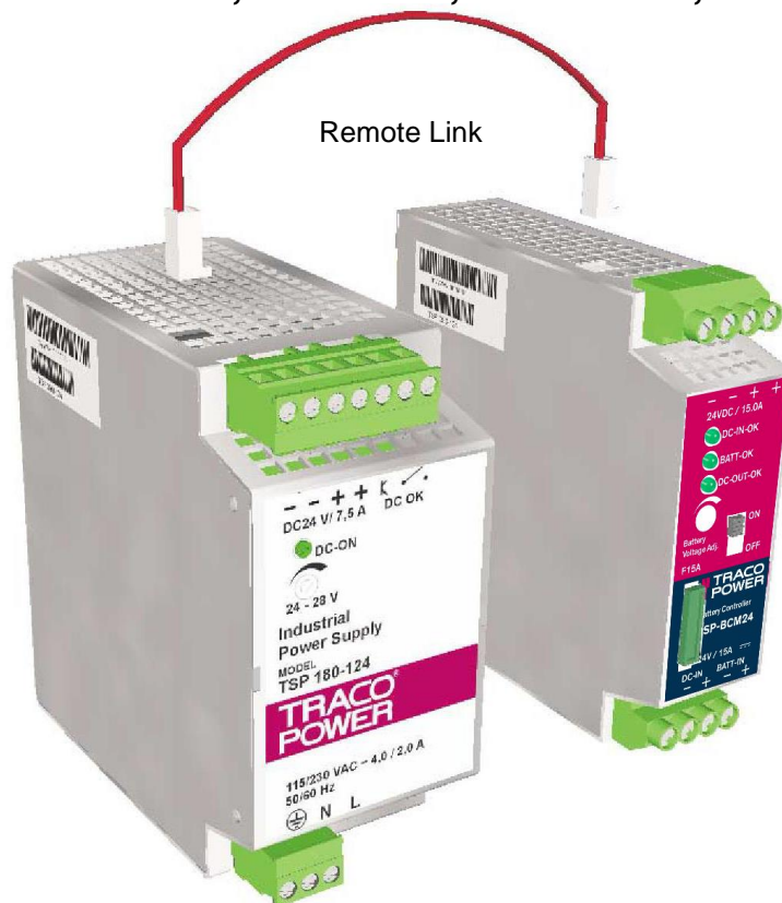
Fig. 1.1: Connection of remote links to Power Supply